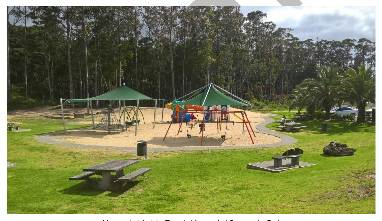
Mangawhai Activity Zone in Mangawhai Community Park

The park has considerable capacity to provide for larger community facilities should these be identified and this has been provided for in the Master Plan.