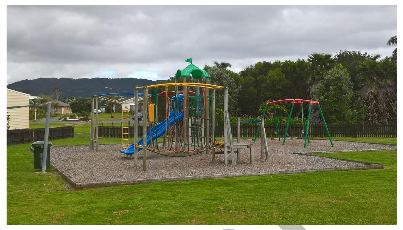
Fagan Place Recreational Area

Fagan Place is located within the Wood Street shopping area in Mangawhai Heads. Located behind the main shopping area on Fagan Place, there is car parking, a community hall and a playground. It adjoins the Council-owned Mangawhai social housing complex. The community hall and playground are located on Council land held in fee-simple i.e. not held under the Reserves Act. The Council property also has an area formerly used for waste water dispersal but has been redundant since 2010 when the Mangawhai Community Wastewater Scheme became operational.