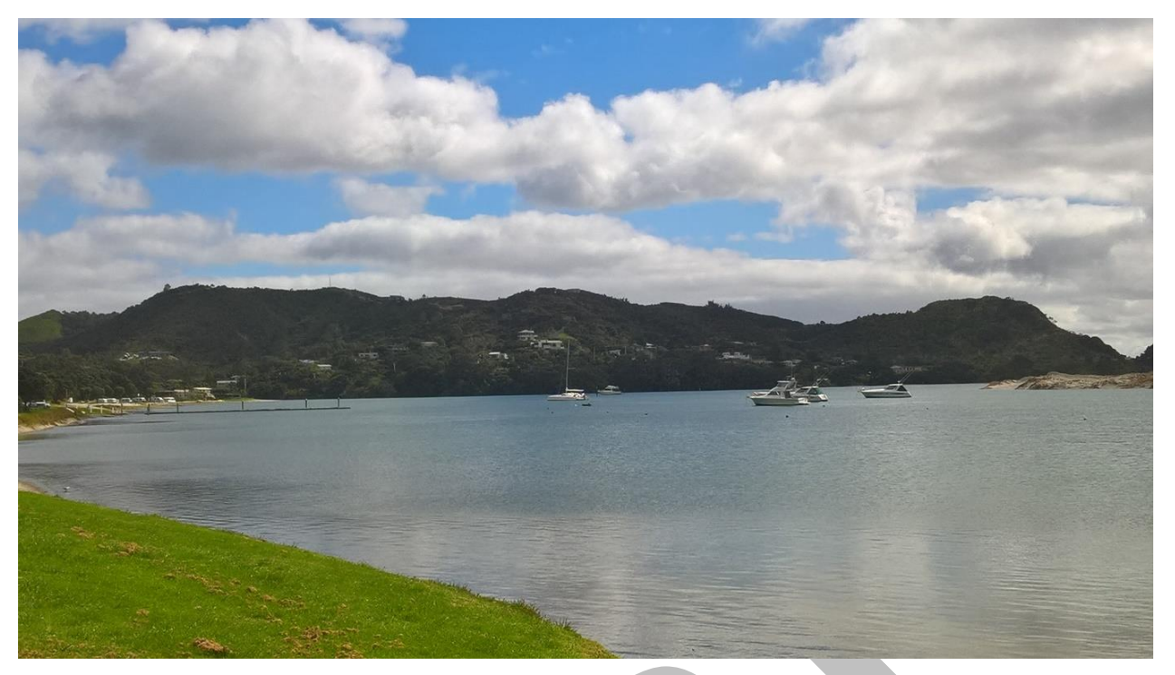
Alamar Crescent esplanade area

Alamar Crescent leads to an esplanade reserve area along the coastal edge between Mangawhai Heads Road and North Avenue. This space offers a range of activities along the waterfront, including two boat ramps, a camping ground, playground, Mangawhai Fishing and Boating Club, picnic tables, public toilets and walking connections both north and south along the coastal esplanade reserve. It is a popular area for locals and tourists to visit and access the harbour.